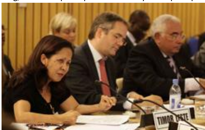
H.E. Mrs. Emilia Pires, Co-Chair International Dialogue, Minister of Finance, Timor-Leste