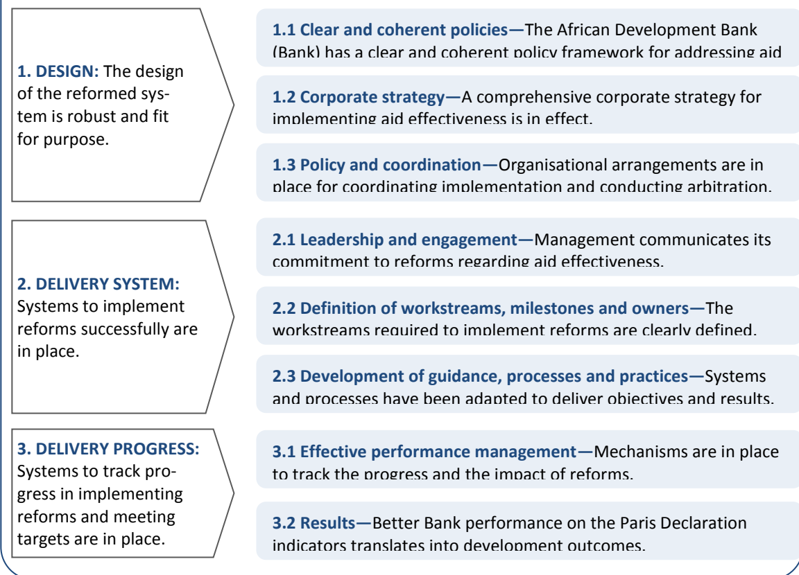
Figure 2: The Conceptual Framework Underpinning the Roadmap’s Approach to Reform 7