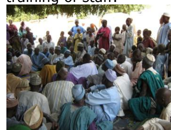
Community planning meeting in Yobe

provision of operational equipment and training of staff.