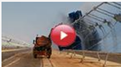
At Ouarzazate, Morocco takes solar lead